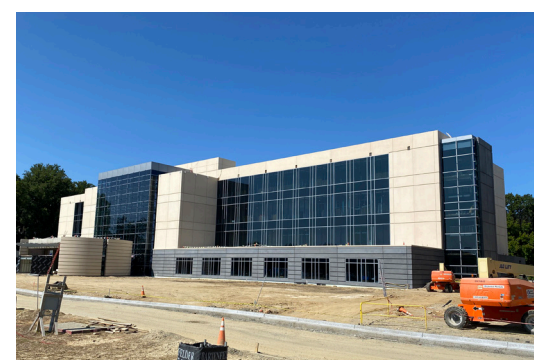
Progress photo from September 2020